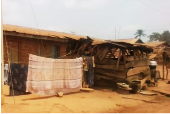
Figure 5: A cooking/storage wooden-shed behind a rural house