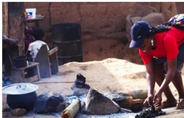
Figure 6: A typical cooking spot at the back of a village house