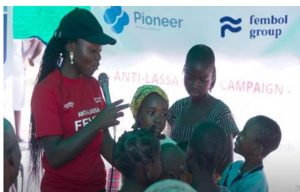
Figure 4: A member of an NGO during an anti-laser fever awareness creation campaign in Osi, a rural area in South Western Nigeria.

Some of their efforts are summarily highlighted in Table 1.