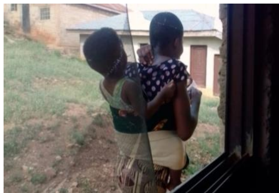
Figure 8: The sights of teenage mothers were not uncommon in some rural areas