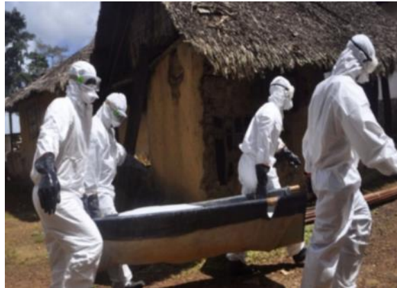
Figure 2: Health workers carrying the body of a woman suspected of contracting the Ebola virus in Bomi situated on the outskirts of Monrovia, Liberia

as viruses or bacteria, or through blood or other bodily fluids. According to the Nigeria Centre for Disease Control, NCDC (2018), Nigeria has been threatened by various infectious outbreaks in different parts of the nation since 2017 including Lassa fever, cholera, yellow fever, monkeypox and cerebrospinal meningitis etc. Although, the country, as well as its neighbouring States like Sierra Leone, Guinea and Liberia (Figure 2), responded effectively to contain these outbreaks, yet early detection, which will allow for the prevention of illnesses and deaths was necessary, a quarter in which Nigeria was yet questionably covering as was evident in the 2020 Coronavirus outbreak that claimed many lives all over the world similar to the 1918 Spanish flu (Influenza) pandemic.