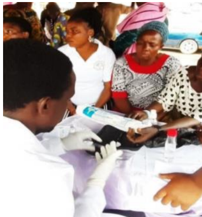
Figure 7: An NGO health volunteer at work in the rural area