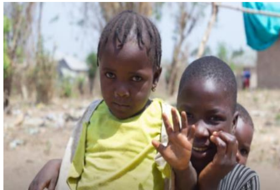
Figure 1: Some children in Osi, a rural area in South-Western Nigeria

social and religious obligations/commitments. Before modern theories were established, people attributed diseases to such things as bad or foul smelling air, earthquakes or sin (PKIDs, 2004-2008). There were even cases in the past when a disease outbreak may be considered as a sort of ‘punishment from a deity’ and all that was considered needed was a ‘sacrifice to appease the gods’ ignorant of the fact that such outbreaks might have been due to ignorable threats. One of such minor or ignorable sources of threats to the well-being of humanity is the unchecked attitude of children towards CD or infections especially in the rural areas. Parents in rural areas, especially in farm settlements, were observed in the course of the study to be ‘careless’ enough. How much more careless and carefree then were the children (e.g. Figure 1), who were more vulnerable and apparently less knowledgeable?